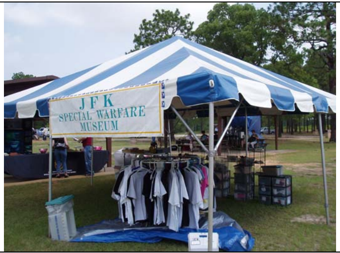
Our table and display for the SFA Convention was set up by Betty, Lois and JB.